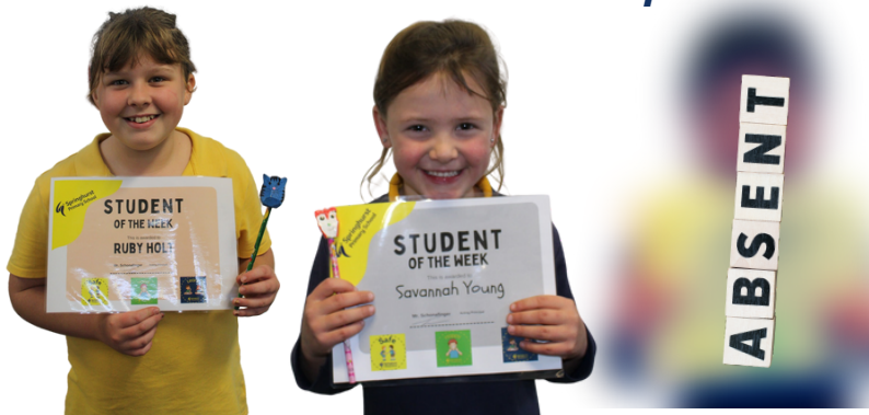
Week 5-- Ruby Week 6 - Savannah Week 7 - Wynter